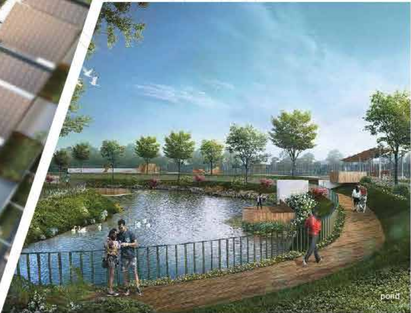
aerial pond view

Disclaimer: All drawings, plans, specifications and details in the literature are to be regarded as indicative or representative of the facts. The developer and its agents do not accept any responsibility for any inaccuracies in the drawings or details. The area shown in the architectural, site, and detail representations contained in the literature is subject to change without notice by the developer and/or the competent authorities and shall not form part of the offer or contract.